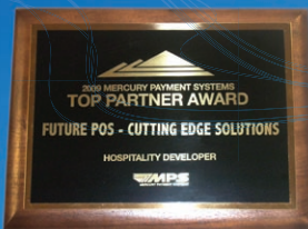
Top Partner Award Hospitality Developer Mercury Payment Systems