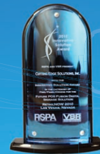
2010 Tabbed Out / Future POS Texas Innovative Solution Award (ISV / VAR Collaboration) RSPA / VSR Magazine Award