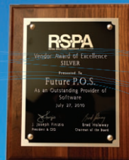
2010 Vendor of Excellence Award Retail Solutions Providers Association